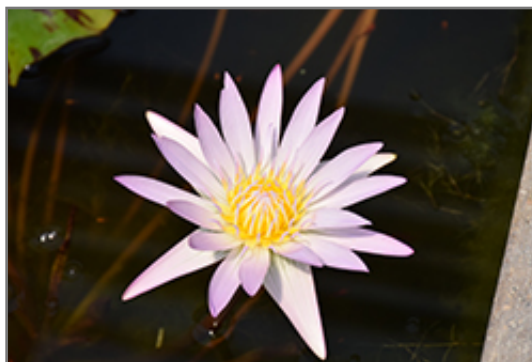
Madame Ganna Walska Tropical Water Lily flowers

Madame Ganna Walska Tropical Water Lily is ideally suited for growing in a pond, water garden or patio water container, and is recommended for the following landscape applications;