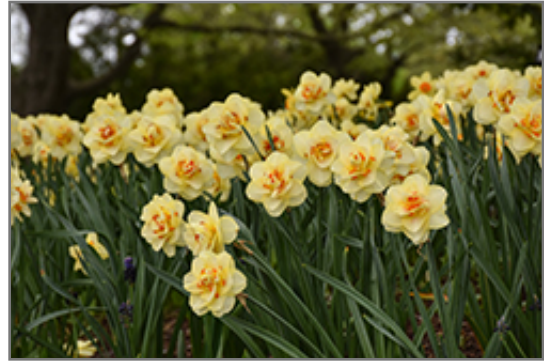
Tahiti Daffodil in bloom

Tahiti Daffodil will grow to be about 14 inches tall at maturity, with a spread of 12 inches. When grown in masses or used as a bedding plant, individual plants should be spaced approximately 6 inches apart. It grows at a medium rate, and under ideal conditions can be expected to live for approximately 10 years. As an herbaceous perennial, this plant will usually die back to the crown each winter, and will regrow from the base each spring. Be careful not to disturb the crown in late winter when it may not be readily seen! As this plant tends to go dormant in summer, it is best interplanted with late-season bloomers to hide the dying foliage.