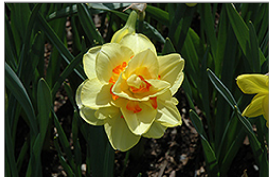
Tahiti Daffodil flowers