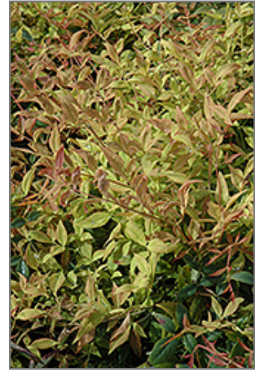
Gulf Stream Dwarf Nandina foliage

Gulf Stream Dwarf Nandina makes a fine choice for the outdoor landscape, but it is also well-suited for use in outdoor pots and containers. Because of its height, it is often used as a 'thriller' in the 'spiller-thriller-filler' container combination; plant it near the center of the pot, surrounded by smaller plants and those that spill over the edges. It is even sizeable enough that it can be grown alone in a suitable container. Note that when grown in a container, it may not perform exactly as indicated on the tag - this is to be expected. Also note that when growing plants in outdoor containers and baskets, they may require more frequent waterings than they would in the yard or garden.