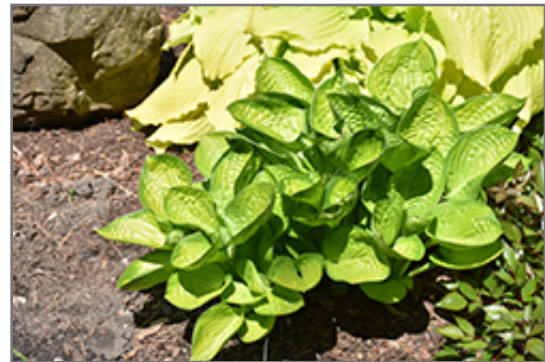
Rainforest Sunrise Hosta