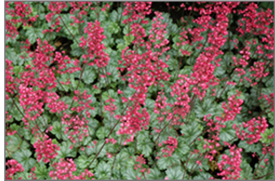
Paris Coral Bells in bloom

Paris Coral Bells will grow to be about 8 inches tall at maturity extending to 14 inches tall with the flowers, with a spread of 14 inches. When grown in masses or used as a bedding plant, individual plants should be spaced approximately 12 inches apart. Its foliage tends to remain low and dense right to the ground. It grows at a medium rate, and under ideal conditions can be expected to live for approximately 10 years. As an evergreen perennial, this plant will typically keep its form and foliage year-round.