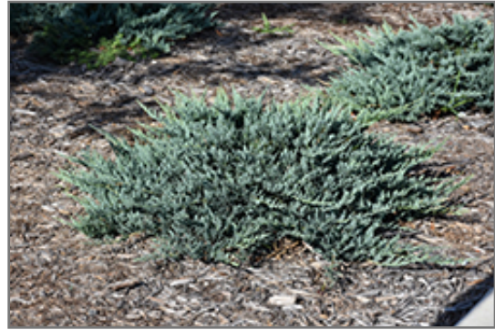
Blue Chip Juniper