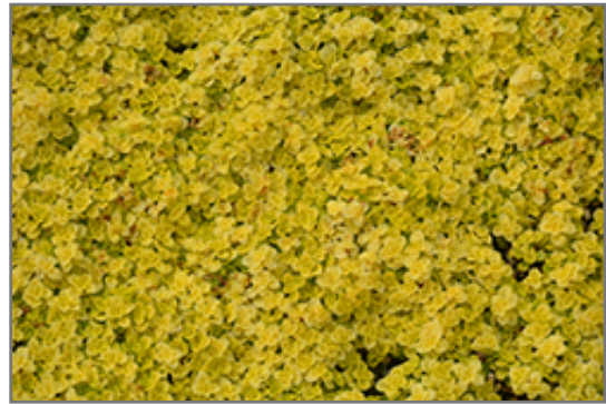
Golden Stonecrop foliage

Golden Stonecrop is recommended for the following landscape applications;