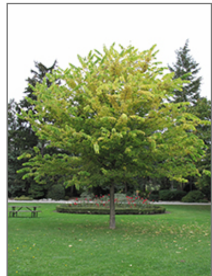
Common Hackberry in fall