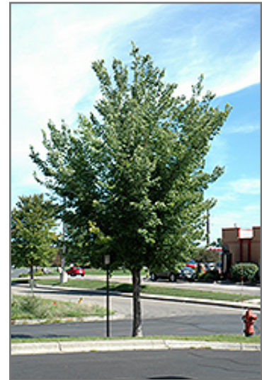
Common Hackberry