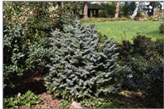
Papoose Dwarf Sitka Spruce