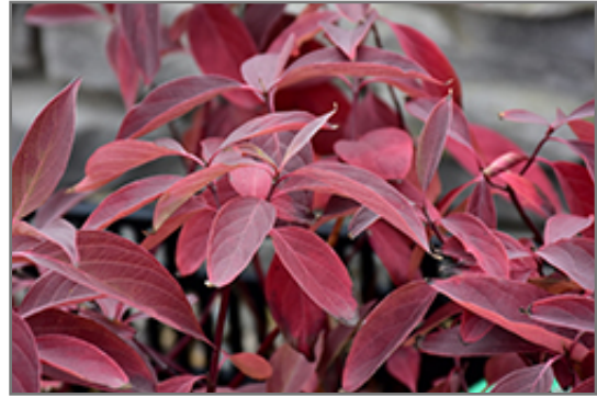
Arctic Fire Red Twig Dogwood in fall

This shrub does best in full sun to partial shade. It is an amazingly adaptable plant, tolerating both dry conditions and even some standing water. It may require supplemental watering during periods of drought or extended heat. It is not particular as to soil type or pH. It is highly tolerant of urban pollution and will even thrive in inner city environments. This is a selection of a native North American species.