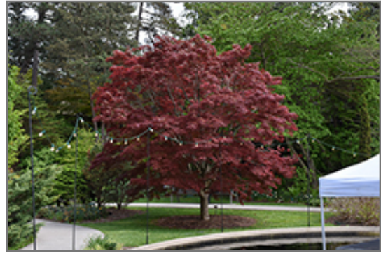
Beni Otake Japanese Maple

This tree does best in a location that gets morning sunlight but is shaded from the hot afternoon sun, although it will also grow in partial shade. Keep it away from hot, dry locations that receive direct afternoon sun or which get reflected sunlight, such as against the south side of a white wall. It prefers to grow in average to moist conditions, and shouldn't be allowed to dry out. It may require supplemental watering during periods of drought or extended heat. It is not particular as to soil pH, but grows best in rich soils. It is somewhat tolerant of urban pollution, and will benefit from being planted in a relatively sheltered location. Consider applying a thick mulch around the root zone in winter to protect it in exposed locations or colder microclimates. This is a selected variety of a species not originally from North America.