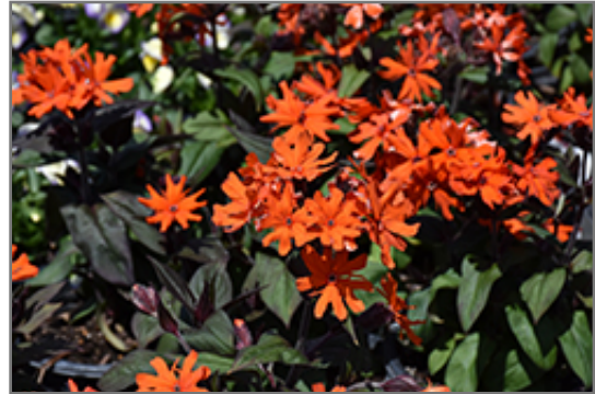
Orange Gnome Champion flowers