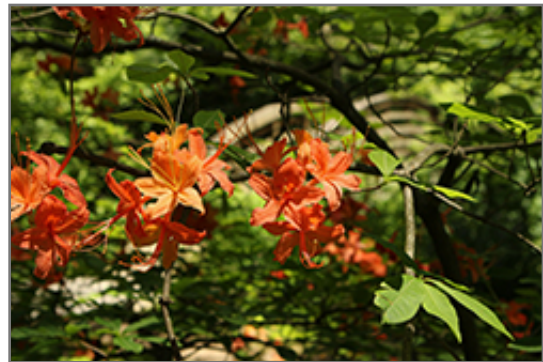
Flame Azalea flowers