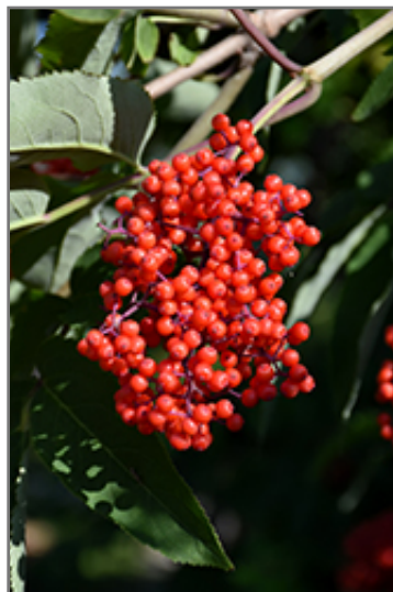
Red Elderberry fruit