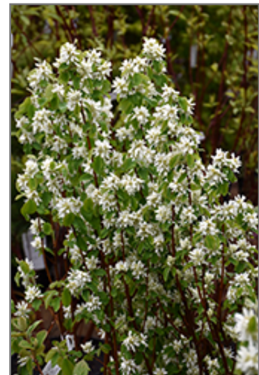
Standing Ovation Saskatoon Berry flowers