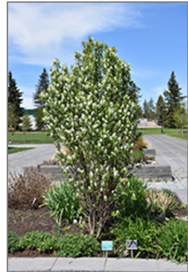
Standing Ovation Saskatoon Berry in bloom