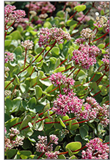
October Daphne flowers

Moana Lane Garden Center & Corporate Office 1100 W. Moana Lane Reno, NV 89509 (775) 825-0600 (775) 825-0602 - Corporate Office