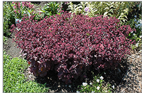
Xenox Stonecrop in bloom

Moana Lane Garden Center & Corporate Office 1100 W. Moana Lane Reno, NV 89509 (775) 825-0600 (775) 825-0602 - Corporate Office