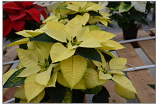
Golden Glo Poinsettia flowers

Poinsettias are bred and grown to be indoor plants, which generally results in dense, shrubby, multi-stemmed plants with a rounded yet upright habit of growth. They are characterized by the ring of showy bracts at the terminal ends of most branches, which are their primary feature of interest. Golden Glo Poinsettia features unusual yellow flat-top flowers at the ends of the branches from early to late winter. The "flowers" are actually comprised of a showy ring of colored bracts (modified leaf structures) surrounding the true gold inflorescence in the center. Its textured pointy leaves remain emerald green in color throughout the season. Since you are not expected to grow this plant out from the way that you purchase it from the store, what you see is more or less what you get for the duration of its functional life.