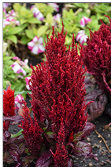
Bright Sparks Bright Red Bronze Leaf Celosia flowers