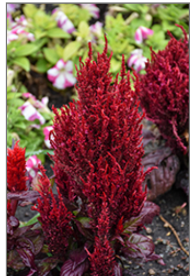
Bright Sparks Bright Red Bronze Leaf Celosia flowers