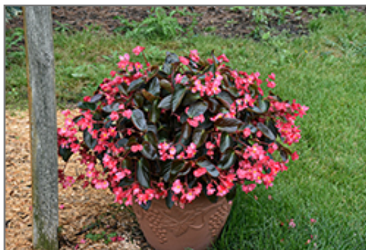
Dragon Wing Pink Bronze Leaf Begonia in bloom