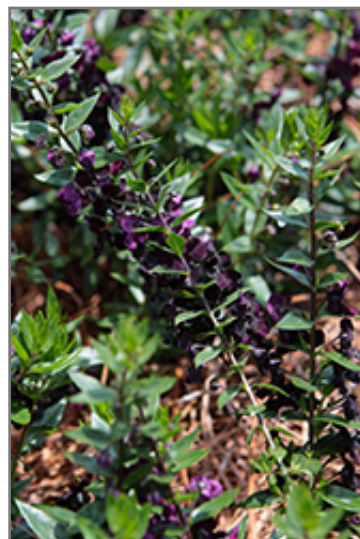
AngelFlare Black Angelonia flowers

AngelFlare Black Angelonia is recommended for the following landscape applications;