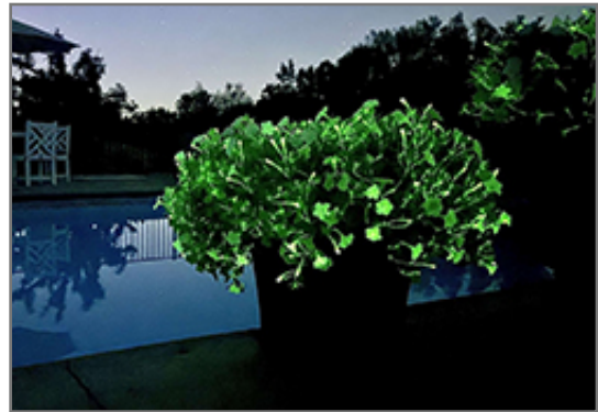
Firefly Petunia flowers

Firefly Petunia will grow to be about 10 inches tall at maturity, with a spread of 14 inches. When grown in masses or used as a bedding plant, individual plants should be spaced approximately 16 inches apart. Its foliage tends to remain low and dense right to the ground. This fast-growing annual will normally live for one full growing season, needing replacement the following year.