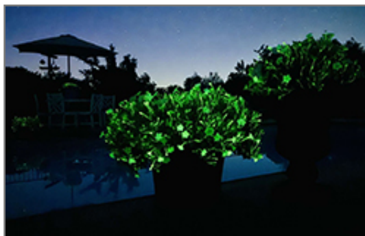
Firefly Petunia flowers

Firefly Petunia is recommended for the following landscape applications;