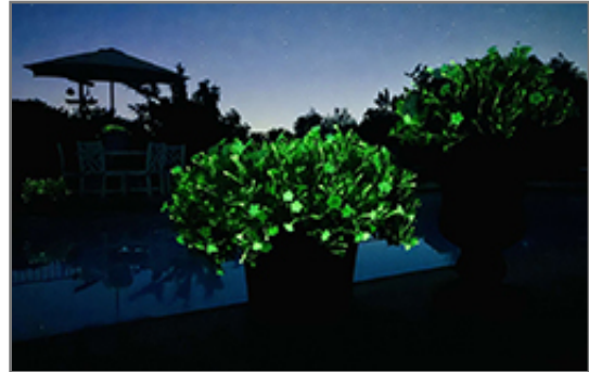
Firefly Petunia flowers

Firefly Petunia is recommended for the following landscape applications;