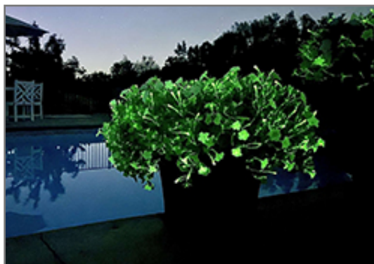
Firefly Petunia flowers

Firefly Petunia is a fine choice for the garden, but it is also a good selection for planting in outdoor containers and hanging baskets. It is often used as a 'filler' in the 'spiller-thriller-filler' container combination, providing a mass of flowers against which the thriller plants stand out. Note that when growing plants in outdoor containers and baskets, they may require more frequent waterings than they would in the yard or garden.