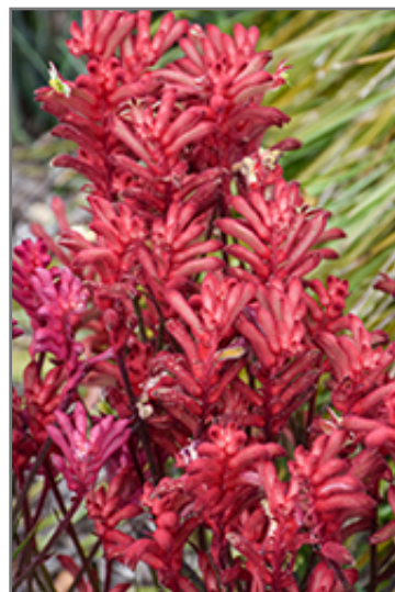
Bush Crystal Kangaroo Paw flowers