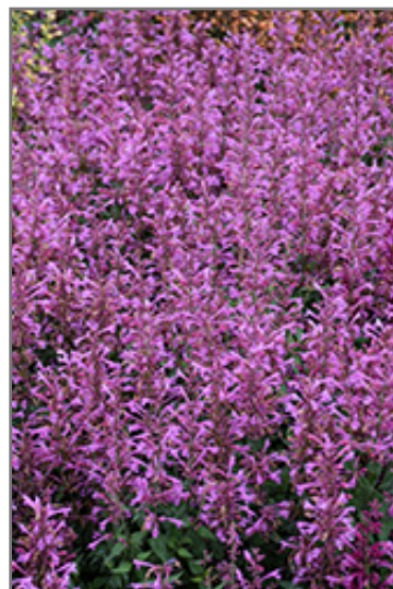
Summerlong Lilac Hyssop flowers

Summerlong Lilac Hyssop is recommended for the following landscape applications;