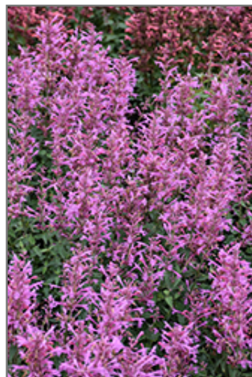
Summerlong Lilac Hyssop flowers

Summerlong Lilac Hyssop is a fine choice for the garden, but it is also a good selection for planting in outdoor pots and containers. It can be used either as 'filler' or as a 'thriller' in the 'spiller-thriller-filler' container combination, depending on the height and form of the other plants used in the container planting. Note that when growing plants in outdoor containers and baskets, they may require more frequent waterings than they would in the yard or garden.