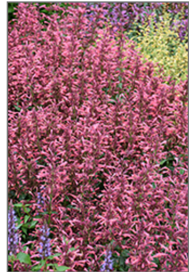
Summerlong Coral Hyssop flowers

Summerlong Coral Hyssop is recommended for the following landscape applications;