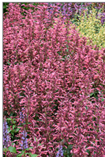
Summerlong Coral Hyssop flowers

Summerlong Coral Hyssop is recommended for the following landscape applications;