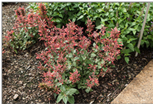
Betterbuzz Red Hyssop in bloom