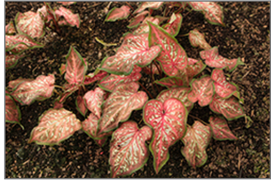
Heart to Heart Caribbean Coral Caladium foliage

This is a dense herbaceous houseplant with a mounded form. Its relatively coarse texture stands it apart from other indoor plants with finer foliage. This plant should not require much pruning, except when necessary to keep it looking its best.