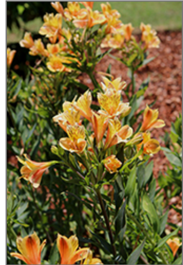
Summertime Alstroemeria flowers