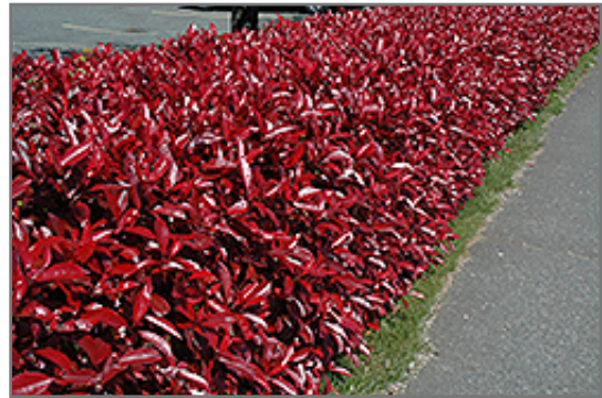
Fraser Photinia

This shrub performs well in both full sun and full shade. It is very adaptable to both dry and moist growing conditions, but will not tolerate any standing water. It may require supplemental watering during periods of drought or extended heat. It is not particular as to soil type or pH. It is highly tolerant of urban pollution and will even thrive in inner city environments. Consider applying a thick mulch around the root zone in both summer and winter to conserve soil moisture and protect it in exposed locations or colder microclimates. This particular variety is an interspecific hybrid.