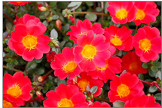
Mega Pazzaz Red Portulaca flowers

This is a relatively low maintenance plant, and should not require much pruning, except when necessary, such as to remove dieback. It is a good choice for attracting butterflies and hummingbirds to your yard, but is not particularly attractive to deer who tend to leave it alone in favor of tastier treats. It has no significant negative characteristics.