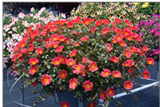
Mega Pazzaz Red Portulaca in bloom