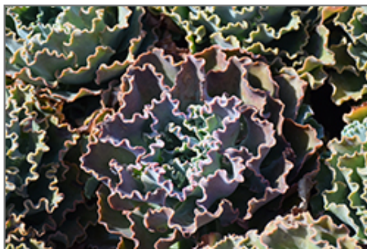
Green Mexican Hens

This is a dense herbaceous evergreen houseplant with tall flower stalks held atop a low mound of foliage. Its relatively fine texture sets it apart from other indoor plants with less refined foliage. This plant should not require much pruning, except when necessary to keep it looking its best.