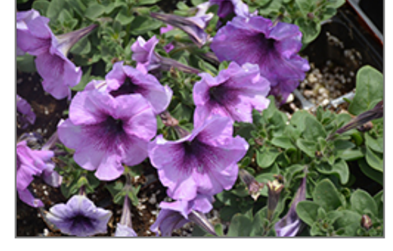
Madness Plum Crazy Petunia flowers

Landscape Services & Design Center 1190 W. Moana Lane Reno, NV 89509 (775) 825-0602 ext. 134 NV Lic. #3379A, D & CA Lic. #317448