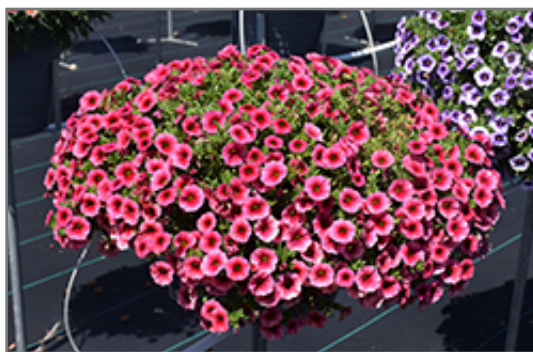
Lia Cranberry Calibrachoa in bloom