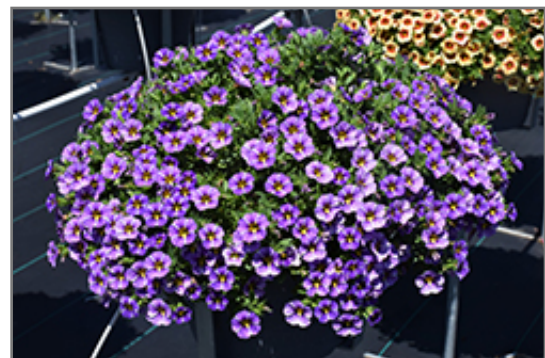
Colibri Purple Bling Calibrachoa in bloom