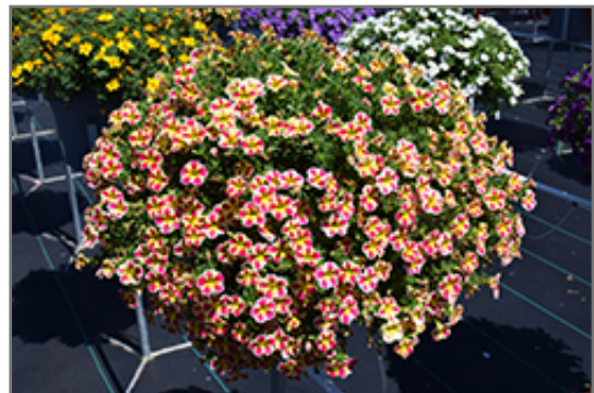
Colibri Abstract Guava Calibrachoa in bloom