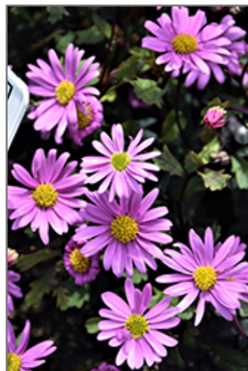
Surdaisy Pink Swan River Daisy flowers

Surdaisy Pink Swan River Daisy is recommended for the following landscape applications;