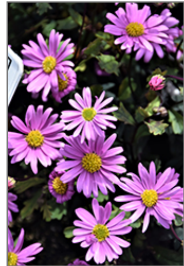
Surdaisy Pink Swan River Daisy flowers

Surdaisy Pink Swan River Daisy is recommended for the following landscape applications;