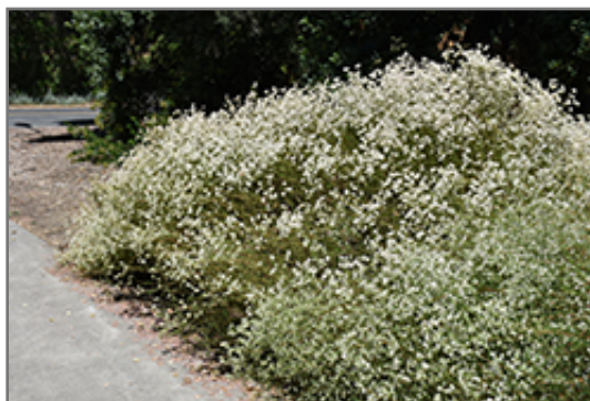
California Buckwheat in bloom

California Buckwheat will grow to be about 6 feet tall at maturity, with a spread of 8 feet. It tends to fill out right to the ground and therefore doesn't necessarily require facer plants in front, and is suitable for planting under power lines. It grows at a fast rate, and under ideal conditions can be expected to live for approximately 20 years. As this plant tends to go dormant in summer, it is best interplanted with late-season bloomers to hide the dying foliage.