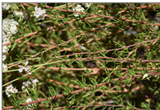
California Buckwheat foliage