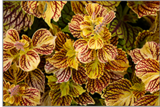
Main Street Venice Boulevard Coleus foliage

Main Street Venice Boulevard Coleus is recommended for the following landscape applications;