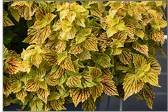
Main Street Venice Boulevard Coleus foliage

Main Street Venice Boulevard Coleus will grow to be about 18 inches tall at maturity, with a spread of 24 inches. When grown in masses or used as a bedding plant, individual plants should be spaced approximately 18 inches apart. This fast-growing annual will normally live for one full growing season, needing replacement the following year.