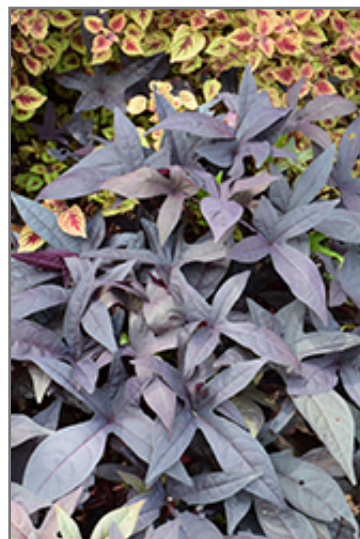
Sweet Georgia Deep Purple Sweet Potato Vine foliage