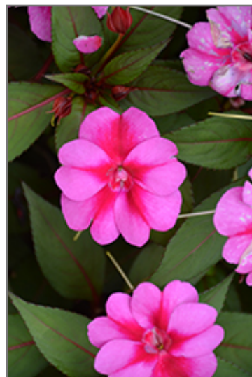
SunPatiens Compact Purple Candy Impatiens flowers

SunPatiens Compact Purple Candy Impatiens is recommended for the following landscape applications;