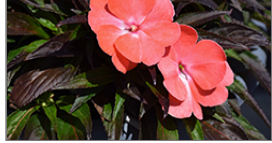
Spectra Rose Impatiens flowers

Landscape Services & Design Center 1190 W. Moana Lane Reno, NV 89509 (775) 825-0602 ext. 134 NV Lic. #3379A, D & CA Lic. #317448