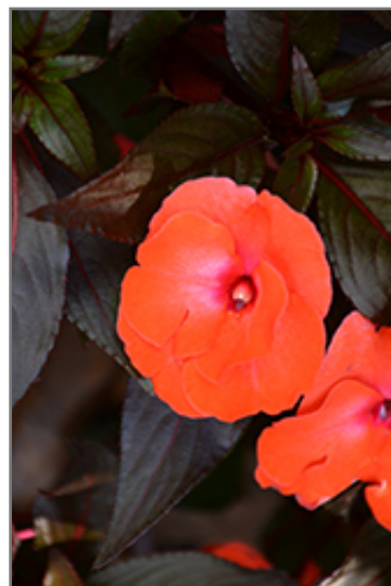
MegaGuinea Orange New Guinea Impatiens flowers

MegaGuinea Orange New Guinea Impatiens is recommended for the following landscape applications;