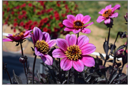
Happy Days Purple Dahlia flowers

Happy Days Purple Dahlia is recommended for the following landscape applications;