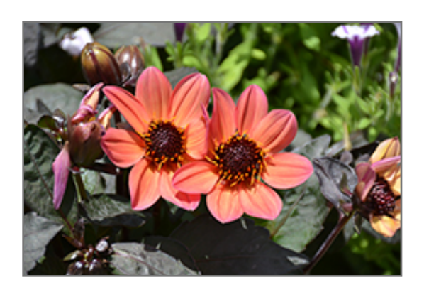
Happy Days Neon Dahlia flowers