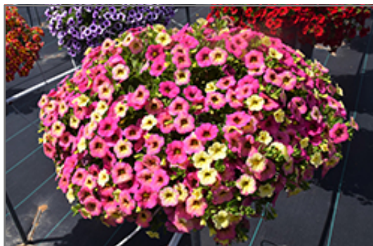
Superbells Prism Pink Lemonade Calibrachoa in bloom

Superbells Prism Pink Lemonade Calibrachoa is recommended for the following landscape applications;