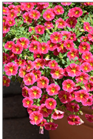
MiniFamous Neo Red Hawaii Calibrachoa flowers

This plant will require occasional maintenance and upkeep. Trim off the flower heads after they fade and die to encourage more blooms late into the season. It is a good choice for attracting bees, butterflies and hummingbirds to your yard, but is not particularly attractive to deer who tend to leave it alone in favor of tastier treats. It has no significant negative characteristics.