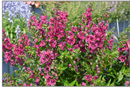
Alonia Big Cherry Angelonia flowers

Alonia Big Cherry Angelonia is recommended for the following landscape applications;