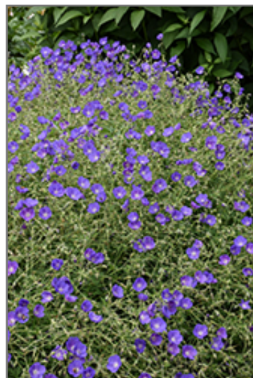
Eureka Blue Cranesbill in bloom

Eureka Blue Cranesbill is recommended for the following landscape applications;