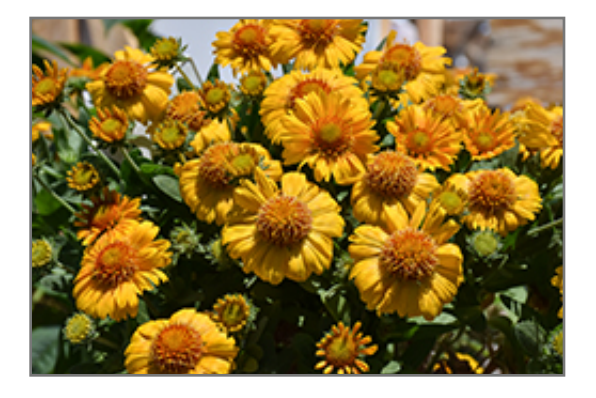
Gusto Saffron Blanket Flower flowers