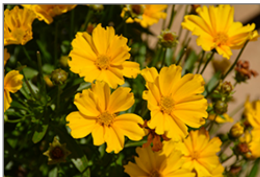
Lil' Bang Goldilocks Tickseed flowers

Lil' Bang Goldilocks Tickseed is recommended for the following landscape applications;